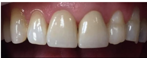
12-21 Layered Zirconia Crowns