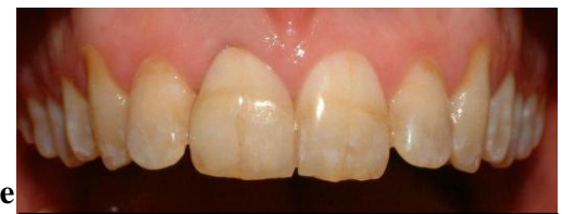
11 Layered Zirconia Crown

If you're interested in learning more about this unique service, or to schedule your first patient's appointment, please call the lab for more details.