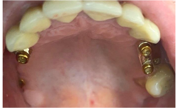
Locator Abutments Intra-Oral