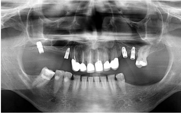
Panoramic X-Ray of Implant Position