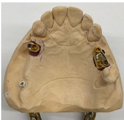
Custom Locator Abutments