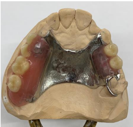
Completed Maxillary Denture