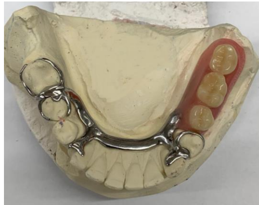
Completed Mandibular Denture