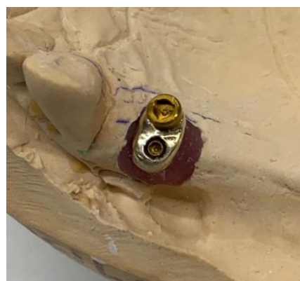
14 Custom Locator Abutment