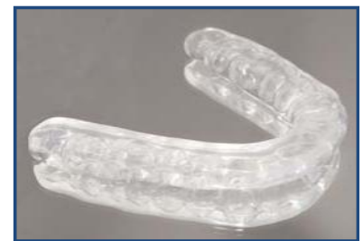
Flat Plane Splints