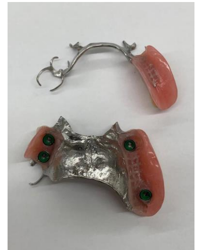
Internal View of Dentures

In the lab, Custom Locator Abutments were fabricated to be parallel with the Locator Abutment in the 17 position. It was decided that the implants in the 24 and 25 positions should be splinted together due to the amount of bone loss and the quality of the remaining bone in the area. Cast partial dentures were fabricated for both arches to replace the missing teeth and Novaloc Inserts were included to engage all four of the Locator Abutments in the maxillary denture for enhanced retention.