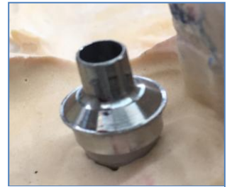
Ti-Base on Analog

Full contour zirconia screw retained restorations can be milled, and in the laboratory cemented directly onto the Ti Base. Aesthetics and function can be achieved at a reduced cost, since there is no need for expensive, cast-to gold components or extra precious alloy that is associated with PFM restorations.