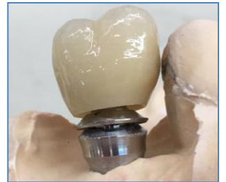
Crown to Fit Ti-Base