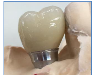
Crown Cemented to Ti-Base