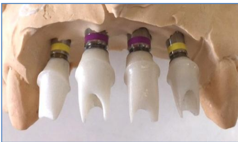
Custom Milled Zirconia Abutments Cemented to Ti-Bases